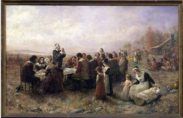
The First Thanksgiving at Plymouth by Brownscombe

"Our harvest being gotten in , our governor sent four men on fowling, that so we might after a special manner rejoice together."