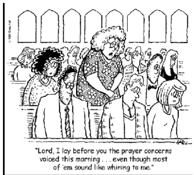
"Lord, I lay before you the prayer concerns voiced this morning . . . even though most of 'em sound like whining to me."

FEEL FREE TO FORWARD ME ANY INTERESTING NEWS WITH PHOTOS REFERRING TO YOUR CHURCH OR MINISTRY THAT WOULD ENCOURAGE THE BRETHREN. THANKS. AND REMEMBER, "LOVE ONE ANOTHER"