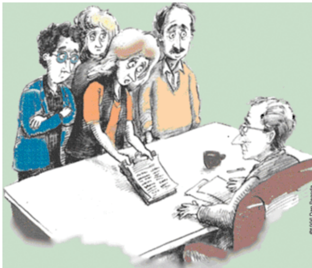
"And this petition requests changing 'sinner' to 'person who is morally challenged.' "