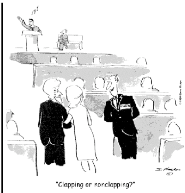
"Clapping or nonclapping?"